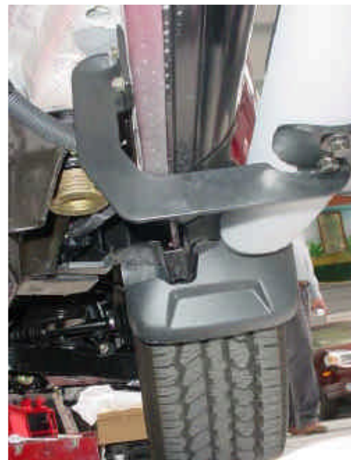
Bracket delantero, lado pasajero.