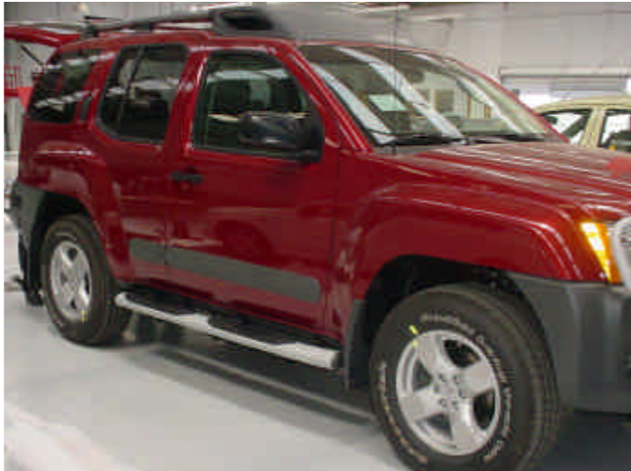
Sidebar installed, passenger side.